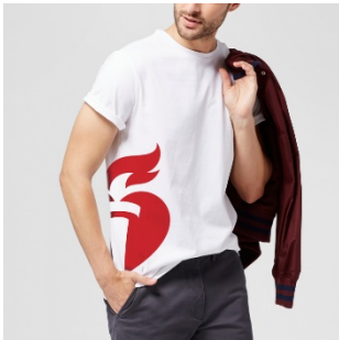
Heart & Torch T-Shirt