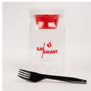
Eat Smart Mason Jar Salad Container