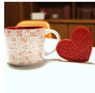
Mug and Coaster Gift Set

Items like these are available at: www.shopheart.org .