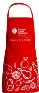
Healthy For Good™ Apron