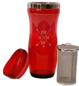
Listen to Your Heart Tea Tumbler