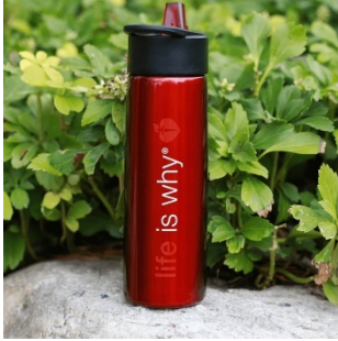
Life is why® Red Stainless Bottle with Flip Spout