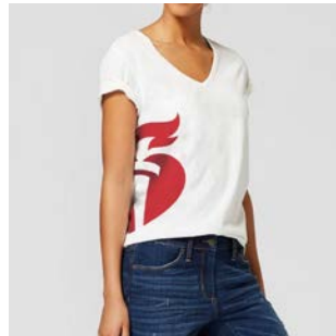
Heart & Torch Ladies' V-Neck