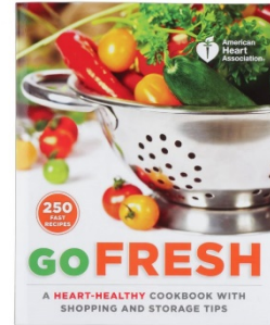
Go FRESH: A Heart Healthy Cookbook