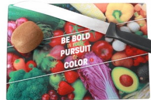
Keep It Colorful Cutting Board