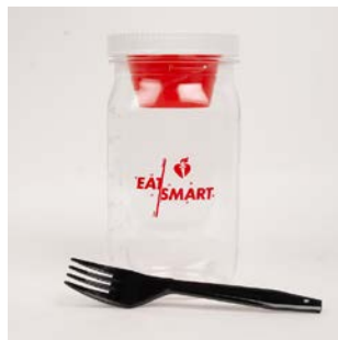
Eat Smart Mason Jar Salad Container