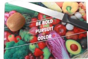
Keep It Colorful Cutting Board