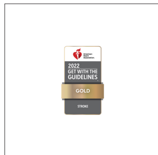
Use of color (other than what's specified in this standards document.)