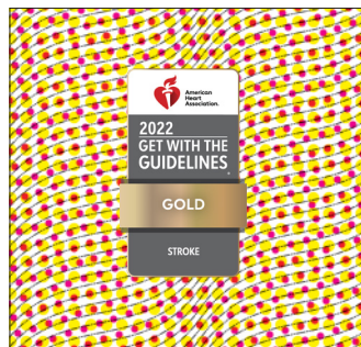
Background with pattern