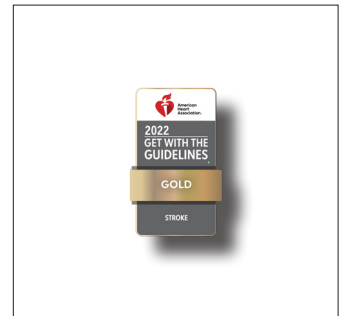
Use of special effects